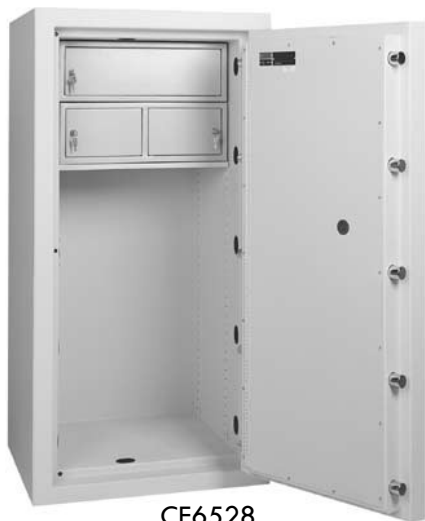
CF6528 SHOWN WITH OPTIONAL INTERIOR LOCKERS